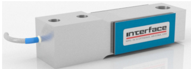
Model SSB (shown)